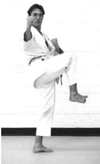
Inside crescent kick block picture 2

geri uke) from left front stance (picture 1)