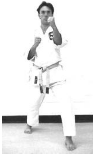
Outside crescent kick block Soto mikazuki geri uke picture 1 Zenkutsu dachi or front stance

d) Down (picture 1) – The right leg is fully extended back to its original position – the front stance.