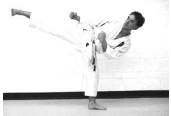
Roundhouse kick picture 3

(Zenkutsu dachi)/ Half front stance (Hanmi dachi)