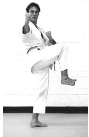
Outside crescent kick block picture 4