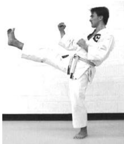
Inside crescent kick block picture 3

c) Retract (picture 4) – The leg continues now to gradually contract along a semi-circular arc, stopping and fully contracting at the opposite 45-degree angle to the lift position, but along the same plane.