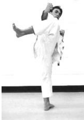
Roundhouse kick picture 2

These next three kicks are normally practised from