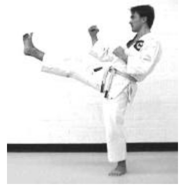
Outside crescent kick block picture 3

c) Retract (picture 4) – The leg continues now to gradually contract along a semi-circular arc, stopping and fully