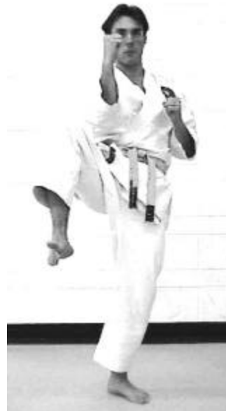
Inside crescent kick block picture 4

Again the knee always remains along the same horizontal line and never deviates.