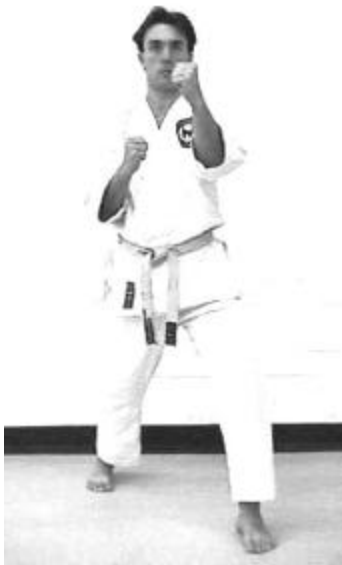
Inside crescent kick block Uchi mikazuki geri uke picture 1 Zenkutsu dachi or front stance

6 – Inside crescent kick block (Uchi mikazuki