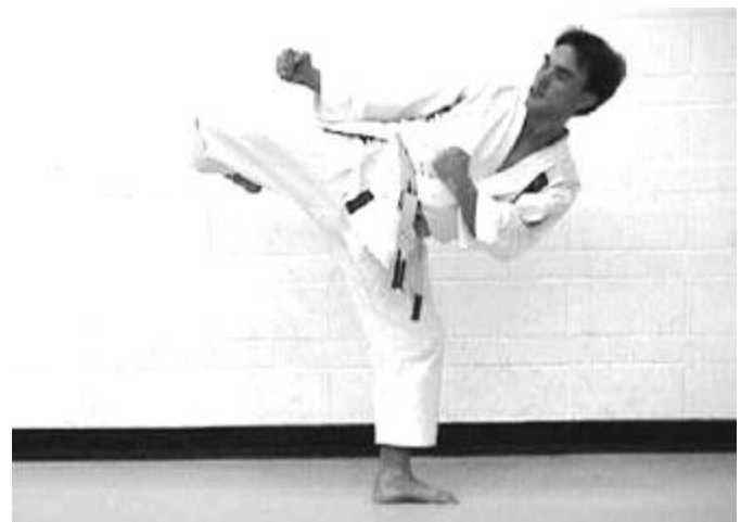
Roundhouse kick picture 4