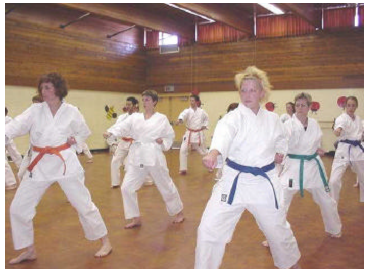
Adult grading at the CASK Hombu