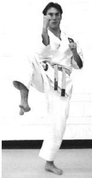
Outside crescent kick block picture 2

This downward movement is an exact reversal to the lift movement.